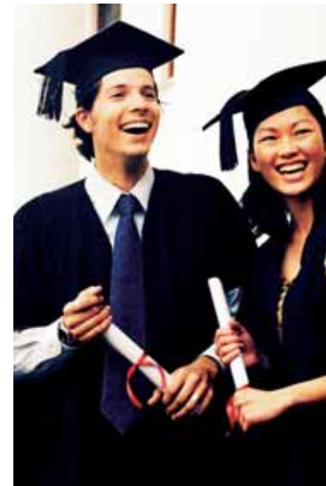
Connecting BRII Recommendations